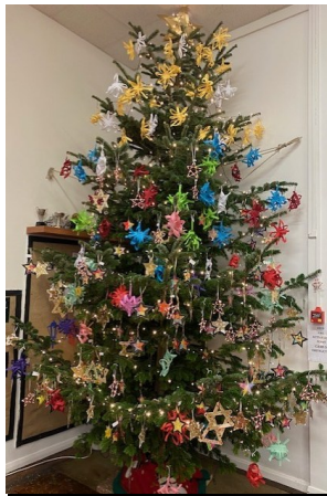
The Christmas tree in the hall –children will bring home their decorations on Friday

Follow us on Facebook: Thornaby CE Primary School