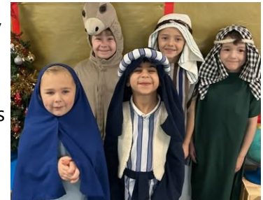
The Shepherds and Mary get ready to perform in KS1's Wrigley Nativity

We have been advised that all earrings should be removed for PE lessons -as even if they are taped up there is still risk of them causing serious injury. There have been cases shared where permanent damage has been caused to the ear and also neck. We would like to avoid this from happening at school. From January, can we please ask that on PE days earrings are either removed by the child or alternatively not worn on PE days.